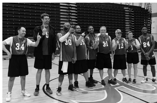
Gold Medal, Unified Team

The Arc appreciates the time and commitment that the coaches gave to make the basketball season possible for our athletes. There were a number of volunteers who assisted with the practices and the athletes and coaches sincerely appreciate your help!