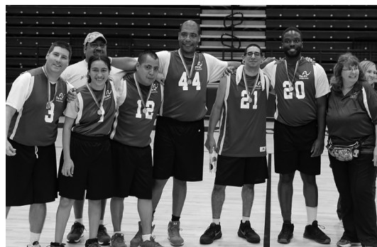
Gold Medal Angels