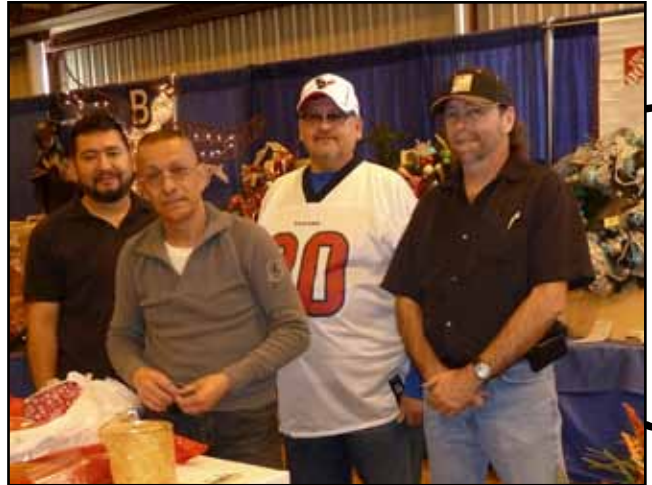
Home Depot Corral volunteers