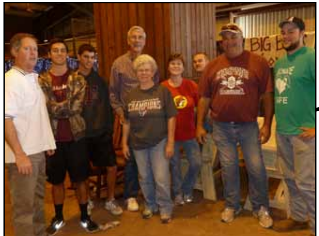
The Patterson Extended Family